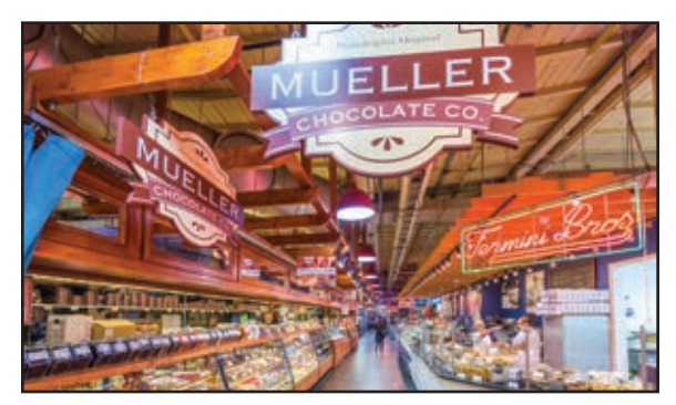
The Reading Terminal Market is a popular attraction for culinary treats.

LOVE sculpture, but is currently the home of the Portal, a giant video installation by Lithuanian artist Benediktas Gylys, featuring a rotation of livestreams from several global cities.