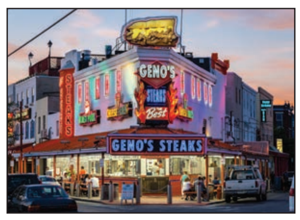
Geno's Steaks, home of "the best cheesesteaks in Philadelphia."

If you're looking for traditional city fare, try Geno's Steaks or Pat's King of Steaks, the catacorner rivals for best Philly cheesesteak; The Olde Bar, in the Old Original Bookbinder's; or Rittenhouse Grill. Wine bars near the convention center include Tria Cafe Rittenhouse and Vintage Wine Bar & Bistro.