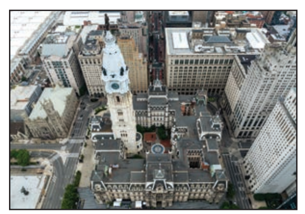
Aerial view of Philadelphia City Hall.

weekends). You can buy a Quick Trip at the airport kiosk for $6.75, or you can purchase a SEPTA Key Card in advance for $4.95 (which is credited to your wallet), and then load it as needed (septakey.org).