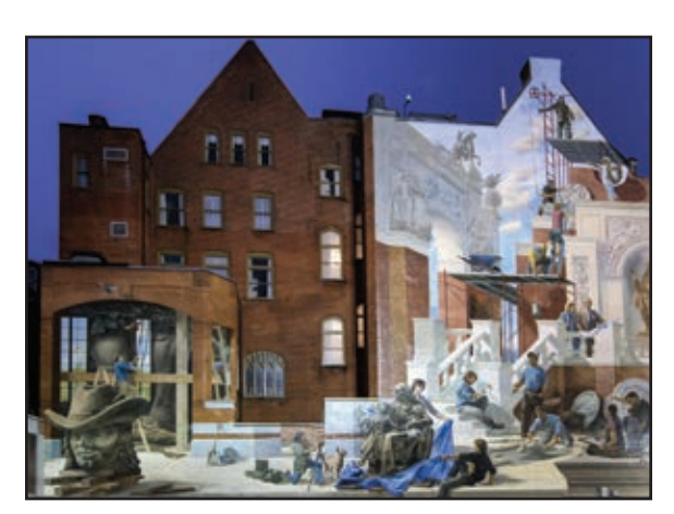
"Building the City," on the famous Mural Mile.

Philadelphia Visitor Centers are located at City Hall, on the Independence Mall, in LOVE Park, and at the base of the Philadelphia Museum of Art. Besides souvenirs and information, the centers offer discounted tickets for tours, attractions, and theater productions. You can also get discounts by using either the Philadelphia Pass (philadelphiapass.com) or the Philadelphia City-PASS (citypass.com), which can be purchased online before your trip. LOVE Park (officially JFK Plaza) not only contains Robert Indiana's iconic