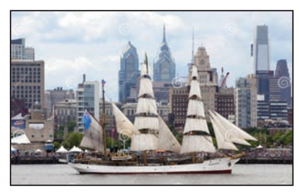
A ship sailing past the Independence Seaport Museum.