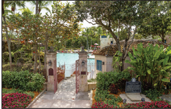
The Venetian Pool in Coral Gables.

largest private contemporary collections in North America. Florida International University operates several art facilities: the Jewish Museum of Florida-FIU , the Patricia & Philip Frost Art Museum , and The Wolfsonian-FIU . Where else but South Beach would one find the World Erotic Art Museum ? But if you want somewhere to take the kids, try the Miami Children’s Museum in Watson Island Park, or travel a little farther north to Fort Lauderdale for the Museum of Discovery and Science .