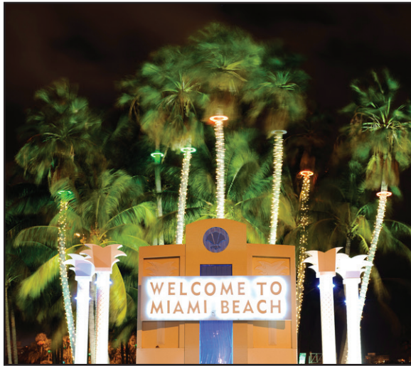
Welcome to Miami Beach.

A fter a two-year pandemic hiatus, the AAO returns to a live annual session May 21-24. COVID-19 is still making its presence felt, since this year's meeting was originally scheduled for Honolulu; when the state of Hawaii reserved the convention center for health services, however, the association had to scramble. Sticking with an ocean setting, the AAO decided to return to Miami Beach for the first time in more than 50 years.