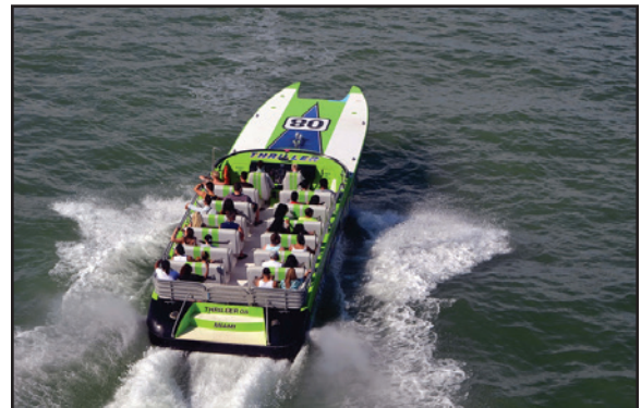
A high-speed sightseeing tour of Miami Beach.

Remember that Miami Beach is not Miami proper, but an artificially enhanced island accessed by bridges from the city. Miami International Airport is still fairly close, with taxi fares at a flat $35 and shared vans about $20 one way. There is also an express bus for only $2.25, departing every half hour from the airport Metrorail station, which is reached by a short tram ride on the MIA Mover. The Mover (accessed on the third level of the terminal, between the Dolphin and Flamingo garages) also connects to the Rental Car Center. Metrorail does not extend to Miami Beach, but has two lines running north and south through Miami.