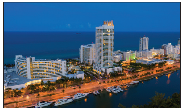
Fontainebleau Miami Beach hotel at night.

The Miami Marlins will play host to the world champion Atlanta Braves in a weekend series May 20-22 at LoanDepot Park.