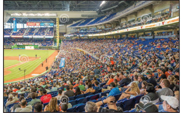
The Miami Marlins play the Atlanta Braves at Loan-Depot Park.

The Miami City Ballet will perform George Balanchine’s Prodigal Son and other works at 7:30