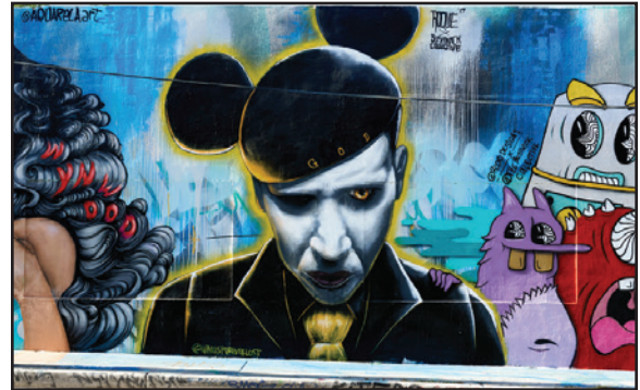
Graffiti at Wynwood Walls outdoor museum in the Wynwood Art District.

Boldface names in this article are listed in the Directory on pp. 115-116 with their telephone numbers and street addresses. The online version of this article (freely accessible) includes live website links; see the JCO Online Archive at www.jco-online.com .