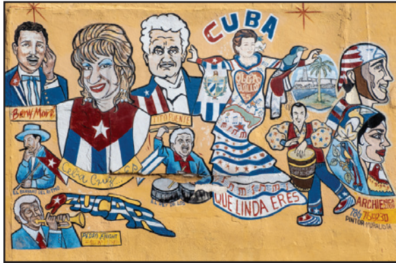
Street painting in Little Havana, Miami.