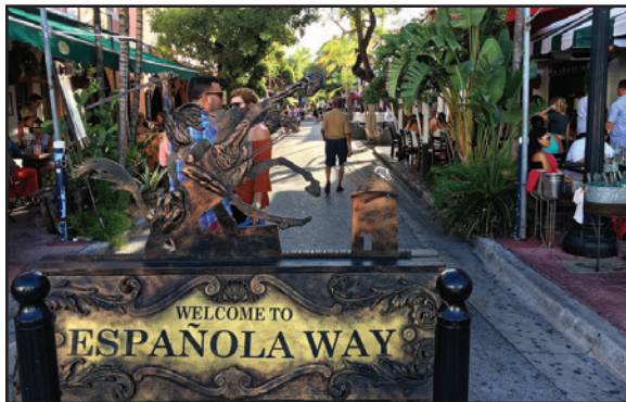
Española Way between 14th and 15th streets in Miami Beach.

Strolling the Miami Beach boardwalk, which stretches from Indian Beach Park on the north to 500 Ocean Drive on the south, is one of the nation’s iconic tourist activities. Mask restrictions may still be in place at the time of the meeting; check www.miamibeachboardwalk.com . Española Way , a pedestrian-only zone between 14th and 15th streets in Miami Beach, has recently been revitalized and decked out in historic Mediterra-