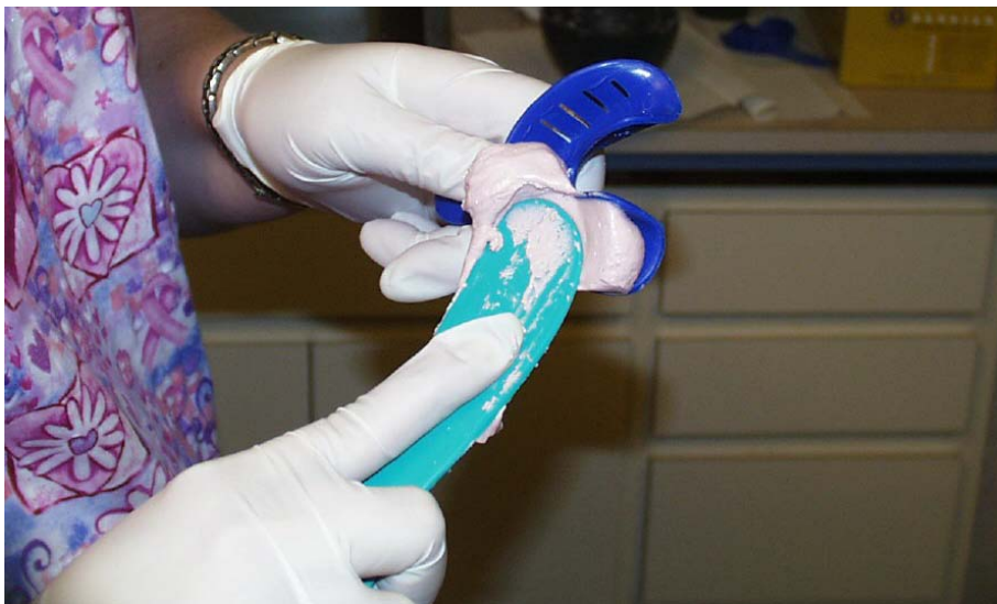
Mixing pudding and putting it in the tray.