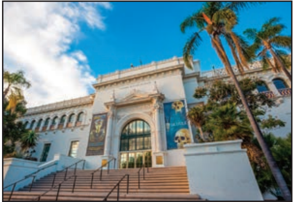
San Diego Natural History Museum.

largest outdoor organ in the Western Hemisphere, housed in a pavilion within the park.