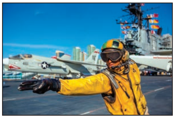
The historic aircraft carrier USS Midway, now a museum.

A play called Red Velvet , depicting a true story of backstage intrigue from early-19th-century London, will be running during the convention at The Old Globe. A new musical called The Geeze and Me is playing at the Tenth Avenue Arts Cen ter. The San Diego Repertory Theater's Roustabouts present the suspense drama Margin of Error at the Lyceum Space. Comedian Jay Larson appears April 21 and 22 at The Comedy Store in La Jolla. The 10th annual CityBeat Festival of Beers takes place on the afternoon of April 22 in North Park.