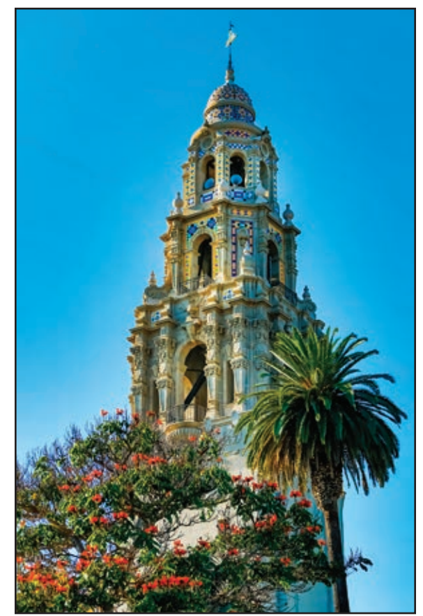
The historic tower at the Museum of Man in Balboa Park.

Boldface names in this article are listed in the Directory on pp. 74-75 with their telephone numbers and street addresses. The online version of this article (freely accessible) includes live website links; visit the JCO Online Archive at www.jco-online.com.