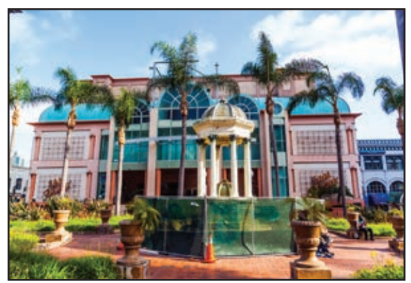
Facades of historic houses in the Gaslamp Quarter.

Just northeast of downtown is Balboa Park, America's largest urban cultural park at 1,200 acres. In addition to the iconic San Diego Zoo , it contains a vast array of gardens and horticultural collections, recreational activities, restaurants, and even a miniature railroad. Of its 15 museums, the most significant is the San Diego Museum of Art , with special exhibitions of sculptor Richard Deacon and modern Japanese prints on display during the convention. The San Diego Natural History