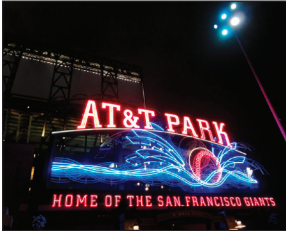
The waterfront AT&T Park will host a three-game series between the San Francisco Giants and Los Angeles Dodgers.

In a concert from the University of California's Cal Performances series, Brazilian brothers Sérgio and Odair Assad will weave their guitar magic at 8 p.m. May 15 in Berkeley's First Congregational Church. Noe Valley Chamber Music closes its season with the San Francisco Piano Trio performing Dvořák, Schubert, and Shostakovich at 4 p.m. May 17 in St. Mark's Lutheran Church.