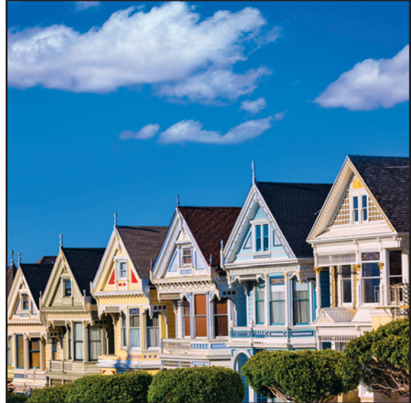
San Francisco's famous Victorian "painted ladies".

Golden Gate Park, established in 1871, is one