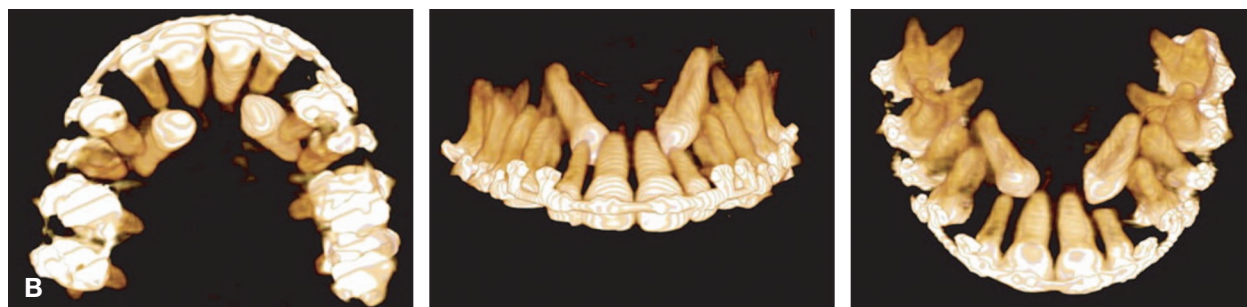
Fig. 2 A. Typical study patient's panoramic radiograph created from cone-beam computed tomography (CBCT) for sector analysis. B. Patient's volumetric CBCT images used to pinpoint root resorption.

beam computed tomography (CBCT) to determine whether maxillary lateral-incisor root resorption can be predicted using a conventional panoramic radiograph and sector analysis.