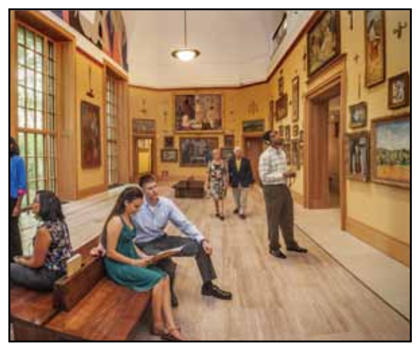
A gallery in the Barnes Foundation.