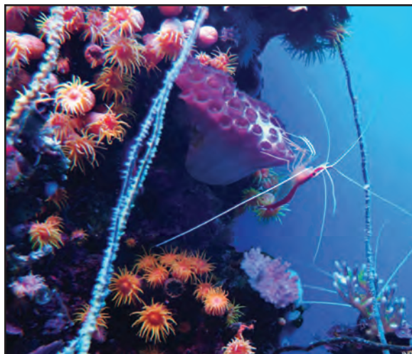
Coral shrimp adorn a colorful Hawaiian reef.

Street features “Regal and Royal Hawaiian Quilts”; “Comforts for the Soul: Han Dynasty Arts for the Afterlife”; “Kawase Hasui: Capturing the Ephemeral”, featuring woodblock prints produced before the 1923 Tokyo earthquake; and “The Living Mirror: Luminaries of 20th-Century Modernist Photography”, including images by Imogen Cunningham and Edward Weston.