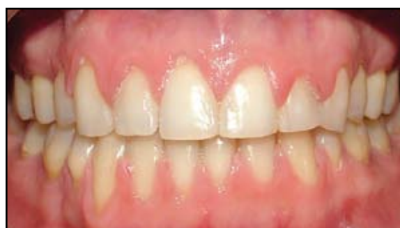
Fig. 2 Diastema eliminated using medium elastic power chain on .016" round stainless steel archwire.

Oral piercings can affect both oral and orthodontic health. 3-7 Body piercings carry considerable risk of initial local and systemic infections and of later cross-infection with pathogens such as hepatitis B and C, HIV, and herpes simplex viruses. 8-11 Body piercings are often performed without, or with poorly controlled use of, local anesthetic