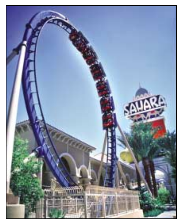
Roller coaster at the Sahara Hotel and Casino.

You can find "tributes" to everyone from Elvis to Liberace around town, but if you're nostalgic for the real thing, try the Temptations and Four Tops at the Stardust Resort and Casino (May 11-13 only); the Platters, Coasters, and Drifters at the Sahara Hotel and Casino ; Blood,