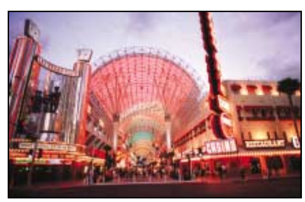
Nightly extravaganza at Fremont Street Experience.

opportunities. Its Bonnie Springs and Old Nevada is a replica of an 1880s mining town, with stables and a petting zoo. Of course, if you'd like to do more traveling, the Grand Canyon and the natural monuments of Utah are a relatively short distance away.