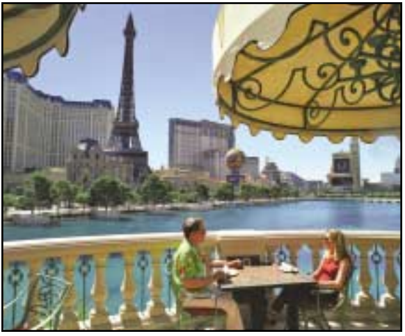
Dining al fresco amid the megahotels on the Strip.

If you want to venture off the Strip, try Rosemary's, a new-American star on the west side; Nobu Matsuhisa's Hard Rock Hotel outlet, Nobu; the Second Street Grill, at the downtown Fremont Hotel; the San Francisco-inspired Triple George Grill; or long-time French favorites Alizé, Pamplemousse, or André's (with the downtown location favored over the Monte Carlo Hotel and Casino branch).