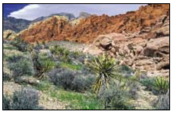
Desert scenery at Red Rock Canyon.

If you'd like to get away from the bright lights and explore the magnificent surrounding desert, the mandatory trip is to Hoover Dam near Boulder City (open daily 9 a.m.-5 p.m.). On the way, you can visit the Ethel M Chocolates Factory and Cactus Gardens and the Boulder City/Hoover Dam Museum. Also nearby are the Lost City Museum of Archaeology and Valley of Fire State Park in Overton. West of Las Vegas, the Red Rock Canyon National Conservation Area is renowned for its cycling, hiking, and climbing