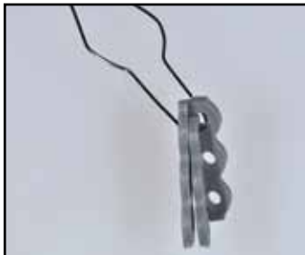
24 Molar Uprighting

An arrangement of white pearls is featured on this month's cover.