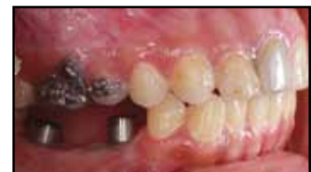
48 Maxillary Molar Intrusion