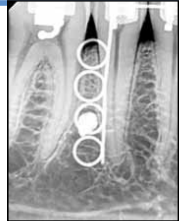
37 Micro-Implant Guide