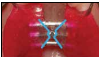
31 Screw Reactivation