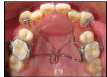
40 Canine Retraction